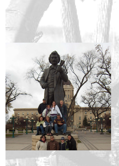
SUNTEP Regina students visit Louis Riel statue at the Manitoba Legislature Building in Winnipeg. October, 2006.

"the cultural mandate of the Institute [is] a key distinctive feature of GDI, which is deemed critical to the success of students, and their sense of belonging and cultural pride."