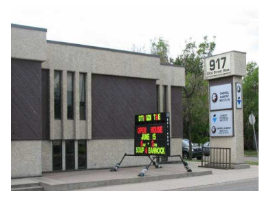
GDI/DTI Building Saskatoon

Mark your calendars for the GDI All-Staff meeting September 24 and 25, 2008 in Saskatoon.